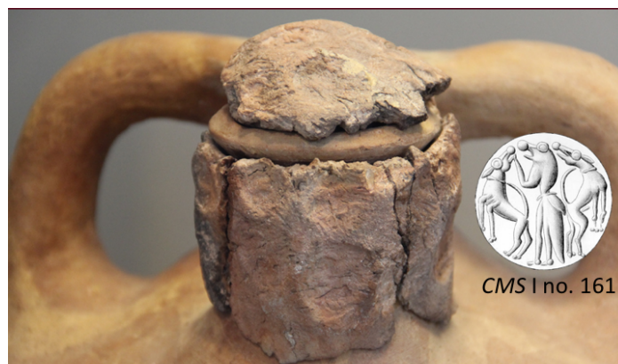
Figure 3 Sealed Stirrup Jar Mycenae, House of the Oil Merchant

Something on transport stirrup jars in general. Most transport stirrup jars were not inscribed – inscribed transport jars have received the bulk of attention due to their intrinsic interest. Stirrup jars were used for the transport of liquid commodities in bulk, and they were carefully stoppered, the clay caps over the stoppers sealed to guarantee the integrity of the contents (Figure 3). They held some 12-14 liters. These jars moved in relatively large numbers within the Aegean and beyond through the Late Bronze IIIB period.