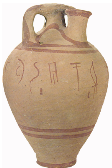
Figure 2 Inscribed Transport Stirrup Jar at Thebes

In the 1960's Palmer accused Evans not only of gross incompetence – and by modern standards this charge has validity -, but also, and more significantly, of deliberate falsification of the evidence. Evans' defenders sprang to his defense with as much energy as Palmer had shown in attacking him. Palmer and John Boardman agreed to work the problem together and author the definitive book, but they failed to agree on virtually anything and published two separate accounts under a single cover (1963). Matters really got out of hand when scholars engaged in this debate turned from Evans and Knossos themselves to attacks on each other's personal and professional integrity and competence, all of this in print, especially in the British journal Antiquity . The editors of Antiquity noted that this dispute reflected "a splendid 18th century feeling for the place of invective and abuse in scholarship." This certainly was a highly emotional, very personal debate. Again, I turn to our Athenian Democracy students, who no doubt recall the invective and abuse in some of the scholarship over the so-called Themistocles Decree, even though in this case its initial publication by Michael Jameson was exemplary.